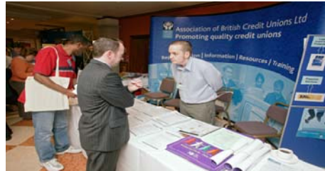
The ABCUL Stand at conference